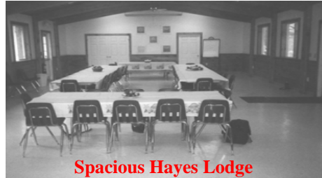
Spacious Hayes Lodge