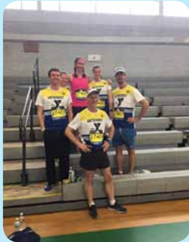
A few of our Boston Marathon runners.