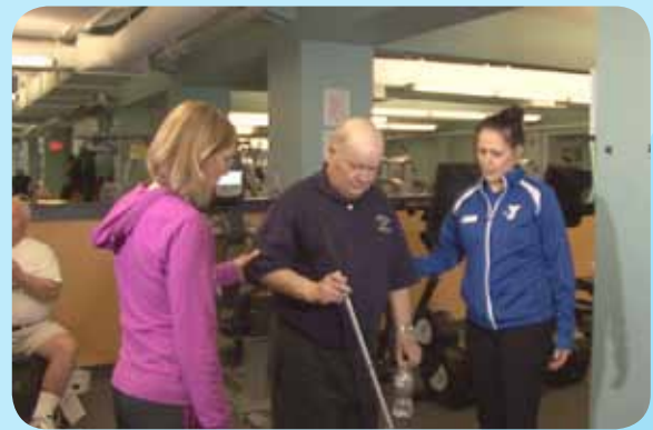
Cardiopulmonary program in action.

MetroWest Medical Center Natick VNA Edward M Kennedy Health Center Performing Arts Center of MetroWest SMOC SOAR 55 (Service Opportunities After Reaching 55) Town of Ashland Town of Framingham Town of Hopkinton Town of Ashland Police & Youth & Family Services Town of Holliston Parks & Rec., Police, Youth & Family Services Town of Hopkinton Police, Parks & Rec., Youth & Family Services Dept. Tufts Floating Hospital for Children United Way of Tri-County Violence Prevention Roundtable Wayside Youth & Family Support Network