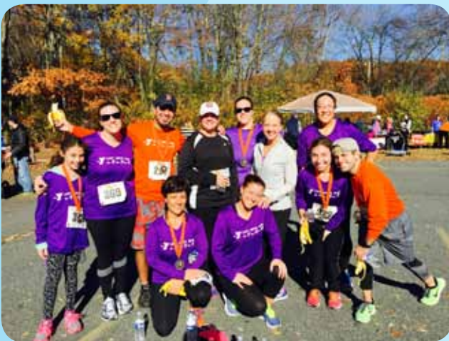
Ashland Half Marathon Y Runners