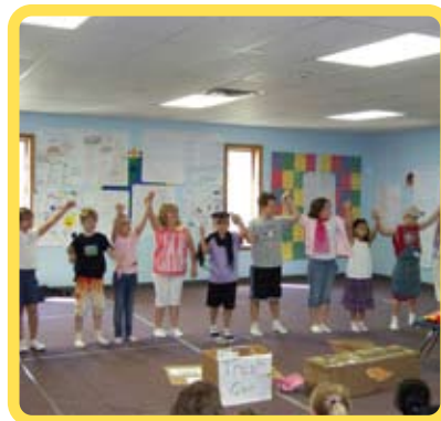
CHILDREN'S EDUCATION & CARE $212,315