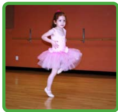
MEMBERSHIPS & CLASSES $212,404