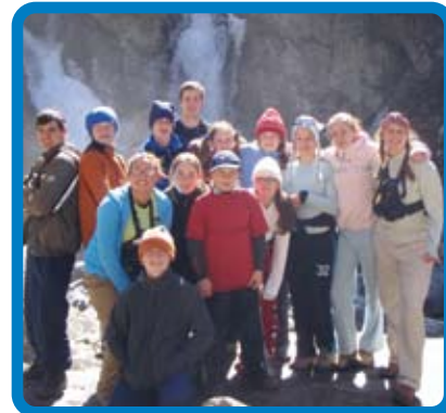
YOUTH & TEEN OUTREACH $188,053

Total Financial Assistance Awarded $795,172