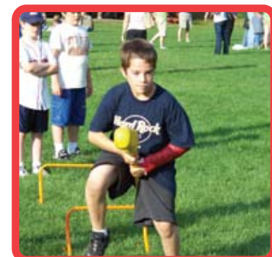
CAMP SCHOLARSHIPS $182,400