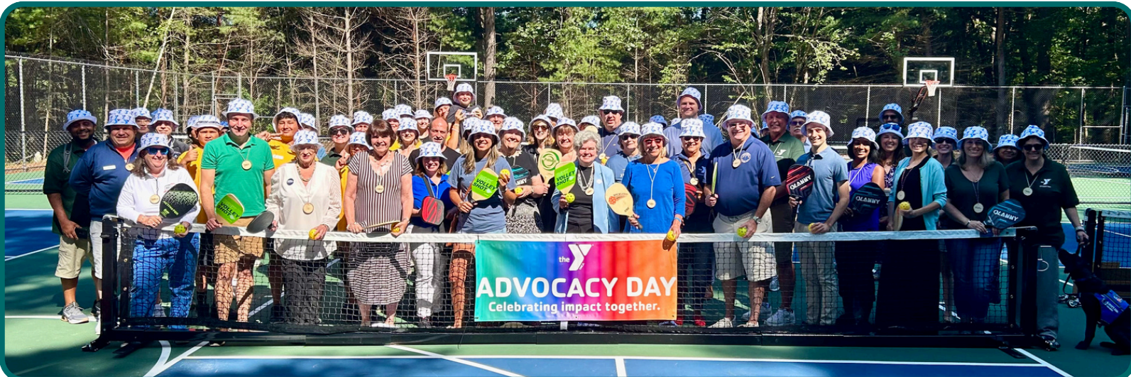
Members of our Y Community, including local municipal leaders, legislative delegation, and staff, gathered to experience camp at our Outdoor Center where we celebrated the work we all do for families in our region