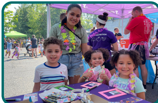
Family enjoying our Summer Eats Kickoff Party where we launched our summer food distribution program