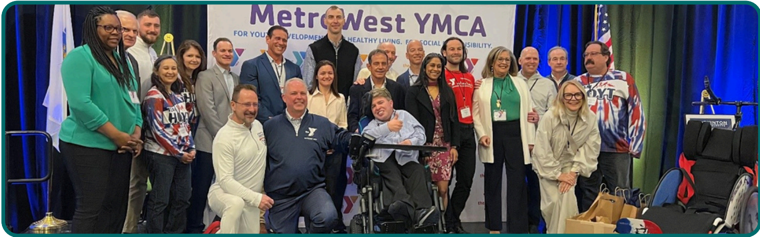
This iconic group photo includes members of our board, award honorees, marathon team participants, and special guests