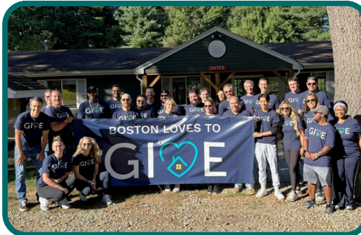
Windsor Communities' volunteers at our Outdoor Center