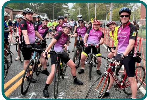
Our team's 25 Mile Cyclists raising funds for the Y