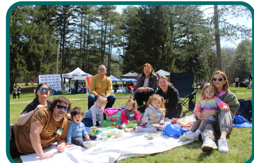
Families enjoying the Teddy Bear Picnic at Healthy Kids Day